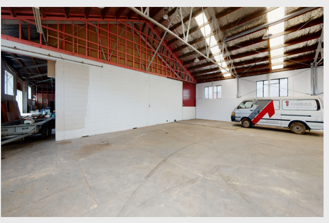
An example scan can be viewed here: https://my.matterport.com/show/?m=nCpiifHWYFc